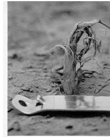
Fig.2. To determine if a damaged stand will regrow, examine several damaged plants to see if the underground growing points are alive (see Fig 3). or wait five to seven days to see if the plants initiate growth.

To estimate stand loss, you must count the remaining viable plants and know the plant population before the damage. To determine the healthy plant population remaining, mark off