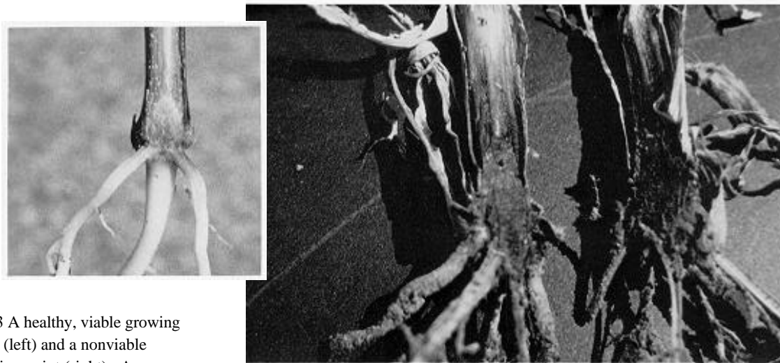
Fig. 3 A healthy, viable growing point (left) and a nonviable growing point (right). Any darkening or softening of the growing point indicates a nonviable (dead) plant.

Next, determine if remaining plants are viable. Plants that have a live growing point (white or cream colored) are considered viable. Dig up a few plants in the damaged area, split each stalk lengthwise with a sharp knife and examine the bottom portion of the stalk to check the growing point. Any darkening or softening of the growing point indicates a nonviable plant. Figure 3 shows a healthy, viable (left) and a non-viable (right) growing point. Since it is sometimes difficult to distinguish a live from a dead growing point immediately after the damage, it may be necessary to wait five to seven days and observe whether plant regrowth has occurred. If no regrowth is visible after seven days, consider that plant dead.