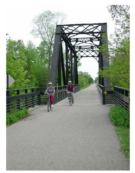
Pere Marquette Trail, Midland

Community leaders in the tri-county area were interested in developing a plan that defined the potential connections for nonmotorized paths linking Bay, Midland and Saginaw Counties. The project was broken into two phases, with Phase 1 of the study looking at the big picture or potential routes to connect each community and Phase 2 taking a more detailed look at these routes, their potential issues and sharing them with other community leaders. Funding for both phases was requested from the Dow Chemical Company. Funding, at this point, has only been received for Phase I.