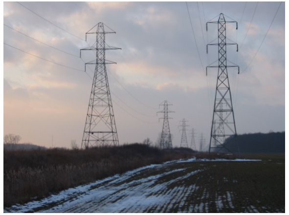
Consumers Energy Easement extending East-West from Kochville Township To Midland Road