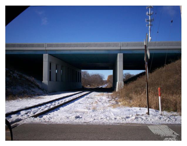
Looking west at the Rail line at I-75