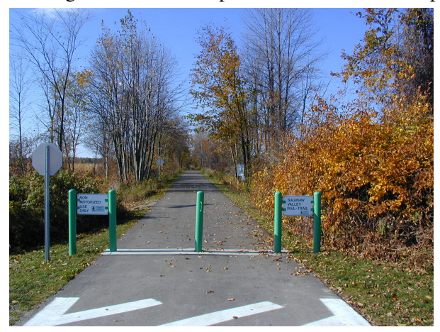
Saginaw Valley Rail Trail

The first meeting focused on getting the committee members together, discussing Phase 1 and 2 of the project and initially discuss potential routes for connection between the three counties. Following this meeting, we drove each potential route and took photographs. We then developed the first draft of the