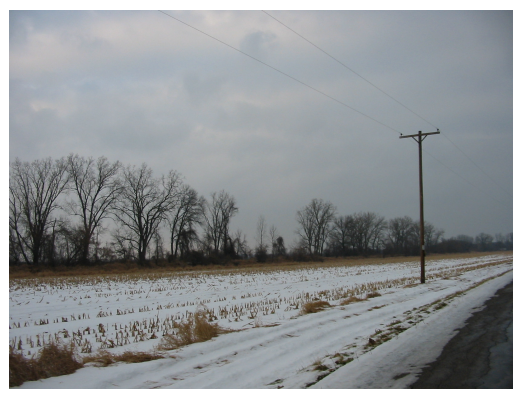
Looking west from Melbourne Rd. at the Rail ROW

The preferred route for the link from Saginaw County to Bay County is an abandoned rail right-of-way (ROW) running on the west side of, and parallel to, the Saginaw River. Bay County committee members have been working with the Land Conservancy to acquire this property for connection to their existing paths and have been approved to write and submit a grant to connect their existing trail to this rail property.